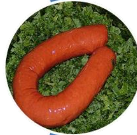
Boerenkool met rookworst (kale with smoked sausage)