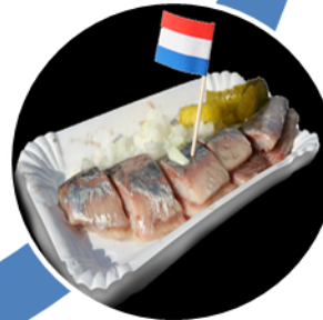
Haring (herring) (raw or in acid)