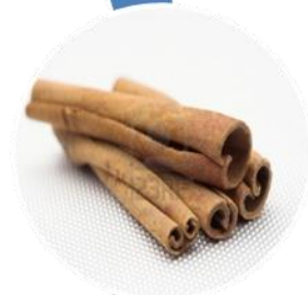
Kaneelstokjes (cinnamon sticks)