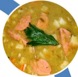
Snert (pea soup)